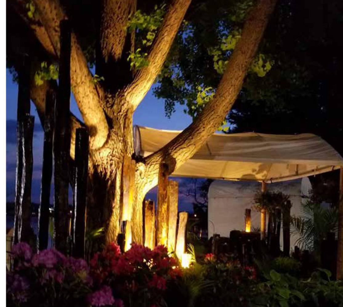
Igneous Rock Gallery Stone Fountains' 2018 Harrisburg Artsfest Display

Life is typically hectic, and moments of true relaxation are fleeting. When it comes time to unwind, you should