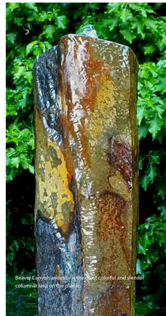
Beaver Canyon andesite is the most colorful and slender columnar lava on the planet.