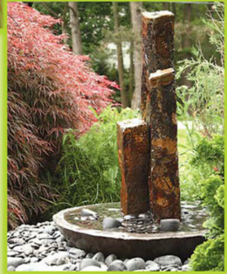
Simple lava rock creates focal points of art.