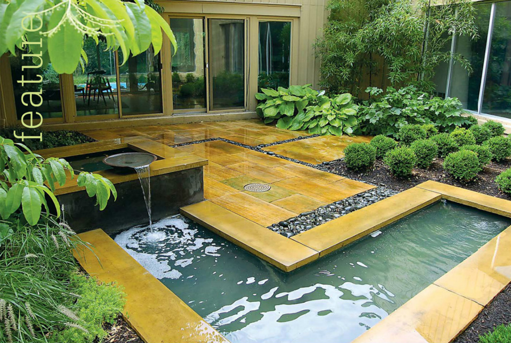
Outdoor living space designed for enjoyment and relaxation.

SPRING IS NOT LONG OFF, AND MANY OF US ARE EAGERLY AWAITING ITS arrival. We'll soon see buds peeking out from our trees or up from the ground.